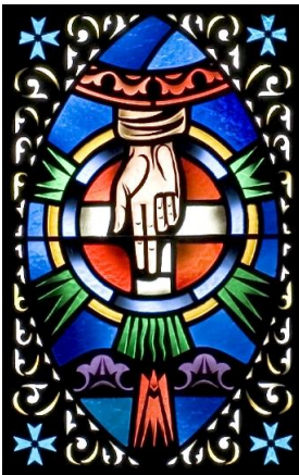
God the Father