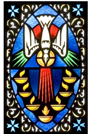
God the Holy Spirit