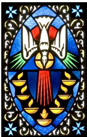
The Holy Spirit